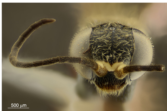
Fig. 7. E. tucumanus ♀ frontal view of head.