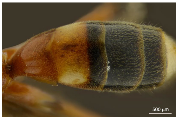
Fig. 5. E. tucumanus ♀ metasoma in dorsolateral view.