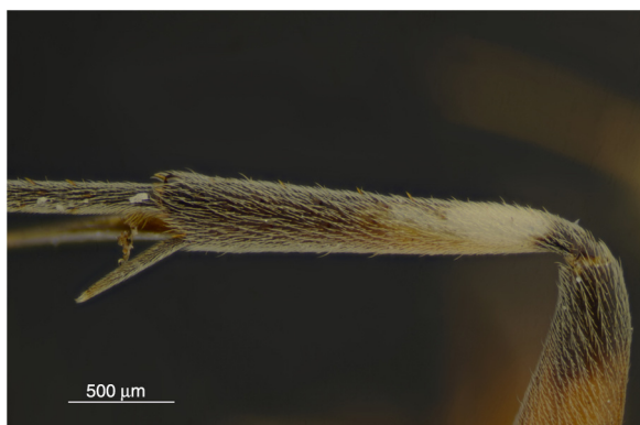
Fig. 6. E. tucumanus ♀ hind tibia.