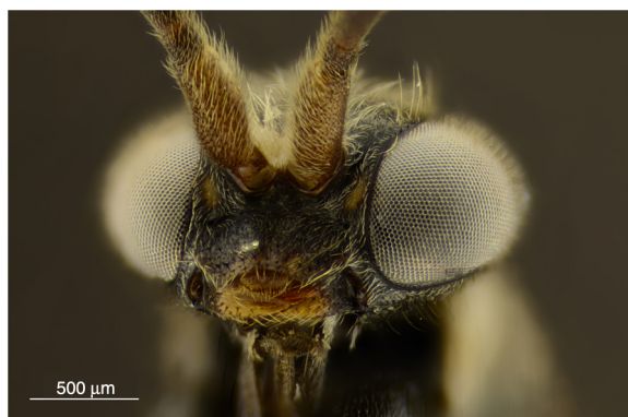
Fig. 8. E. tucumanus ♀ front ventral view of head.