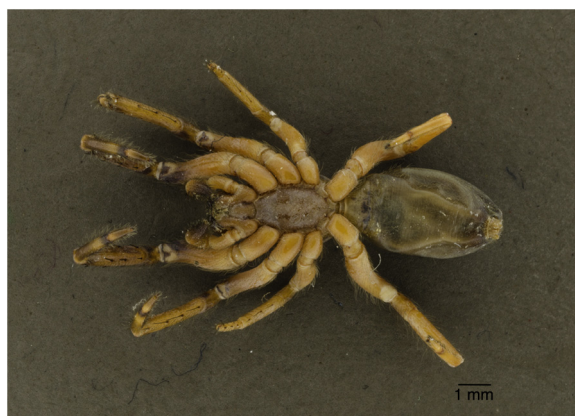
Fig. 10. Ariadna boliviana ventral view.

white spots between the antennal lobes and eyes (Fig. 8). In view of these differences possibly the specimen represents an undescribed species.