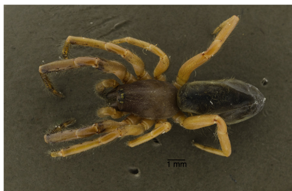
Fig. 9. Ariadna boliviana dorsal view.