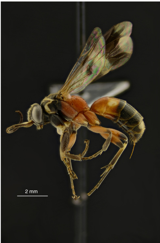
Fig. 2. E. tucumanus ♀ lateral habitus.