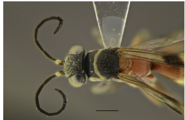
Fig. 3. E. tucumanus ♀ dorsal view of head and thorax.