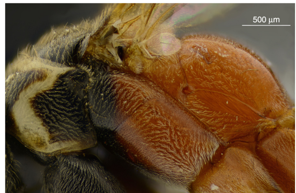
Fig. 4. E. tucumanus ♀ thorax in lateral view.